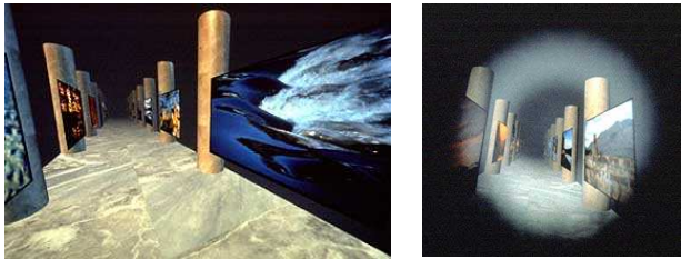
Figure 4. Rita Addison's CAVE-based Detour: Brain Deconstruction Ahead was hailed as the first "empathic" VR. (Images used with permission from the artist.)

found impossible to describe with words [2]. She subsequently created similar works to help family members of stroke victims better understand what their loved ones were experiencing.