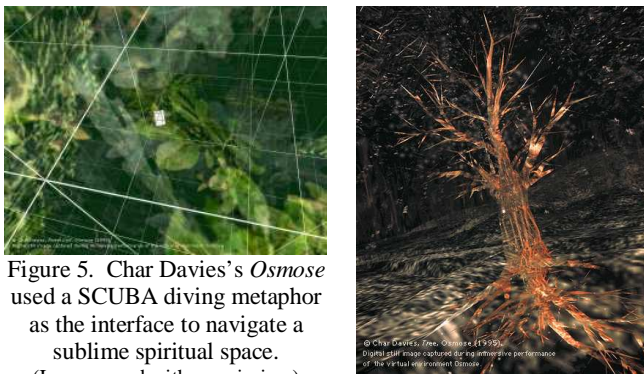
Figure 5. Char Davies's Osmose used a SCUBA diving metaphor as the interface to navigate a sublime spiritual space. (Images used with permission.)

Char Davies' Osmose [20] is a unique exploration of personal psychic and emotional space. Davies sought to shift the focus from action and agency to presence and immersion, or what she terms "immersence." "Immersents" were placed into a sublime relationship with an abstract environment that blended naturalistic forms with highly technological representation and textual poetry. There was no overt goal and using a head-mounted display and sensors, players navigated in a fashion modeled after SCUBA diving, inhaling to rise, exhaling to sink and leaning from side to side to navigate. This is a radically different relationship to space than games such as Doom [36], which are focused on tactical agency and strategic exploitation of spatial constraints. Visitors to this environment described falling into a meditative state [51].