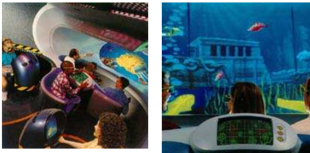
Figure 1. Virtual Adventures , designed by co-author Pearce for Iwerks Entertainment and Evans & Sutherland in 1993.

Co-author Pearce developed a VR theme park experience that placed players in teams for an underwater adventure to save the Loch Ness Monster’s eggs [68]. This attraction was specifically designed to appeal to diverse ages and particularly to women, based on the theme parks industry’s model of targeting diverse audiences and marketing to female heads of households. Combining a scenic underwater fantasy environment, team-based cooperative and competitive play, a treasure hunt/exploratory game mechanic, and prehistoric monsters, resulted in a game that appealed across a broad spectrum of player types.