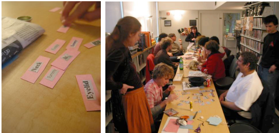
Figures 2 and 2a: Making and playing games using Surrealist techniques.