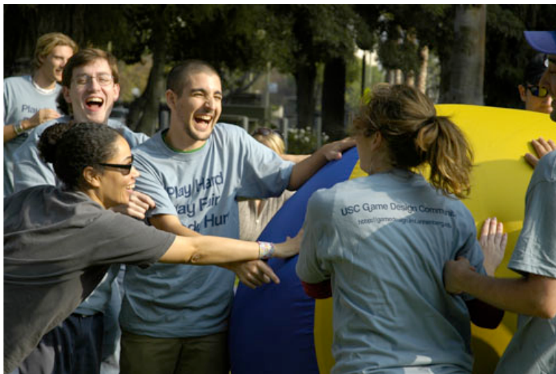
Figure 1: A spirited Earth Ball game at the USC New Games Day.

By holding more cooperative play events the community hopes to keep this important discussion open and improve the meta-discourse regarding the social mechanisms of digital games and how they can be improved for more quality social interaction – for both players and development teams.