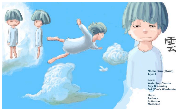
Figure 5: Cloud , an experimental mechanic involving complex emergent cloud formations and fantasy play.

Cloud is the second game funded by the grant, and its team is also made up of students from the School of Cinema-Television and the Viterbi School of Engineering. This game concept pushes the envelope play. In Cloud , the player can fly up in the clouds and change their shapes, gathering clouds and building cloud formations. This simple, fantasy mechanic evokes our daydreams as children, wishing we could fly up into the clouds and play. For the development team, Cloud is a rich area of exploration into emergent environments and innovative design.