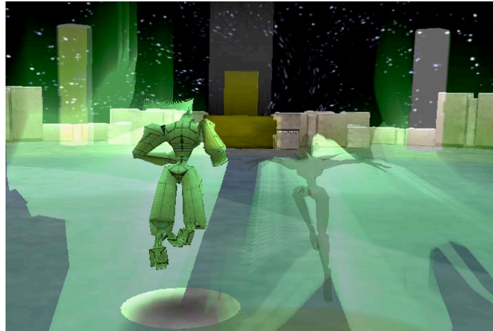
Figure 4: Dyadin , a cooperative action puzzle produced collaboratively by Interactive Media and Computer Science students.

Dyadin was the first game funded by the Game Innovation Grant, and has a crew made up of students from the School of Cinema-TV Interactive Media Division and the Viterbi School of Engineering. This game was showcased at the 2005 Game Developers Conference as a student winner in the Independent Game Festival.